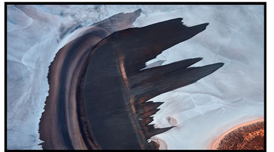
"Wind + Water" 2016 | Lake Amadeus NT. 2400 x 1400 mm | $8,800