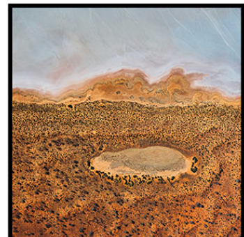
"Jupiter" 2016 | Lake Amadeus NT. 1400 x 1400 mm | $5,200