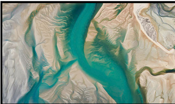
"The Tempest" 2018 | Willies Creek WA. 2400 x 1400 mm | $8,800