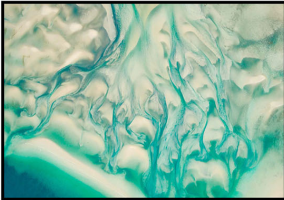
"Ebb & Flow" 2018 | Hervey Bay, QLD 2400 x 1400 mm | $8,800