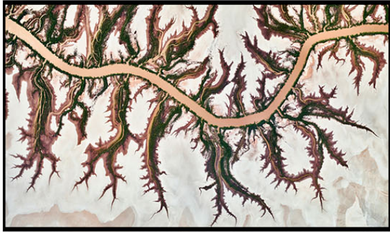
"The Serpent" 2016 | Kimberley Coast NT. 2400 x 1400 mm | $8,800