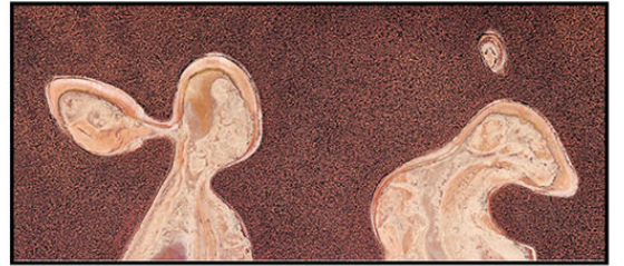
"Rabbit & Roo" 2019 | Shark Bay WA. 3000 x 1400 mm | $11,000