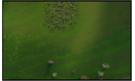
"Counting Sheep" 2017 | Kangaroo Island SA. 2400 x 1400 mm | $8,800